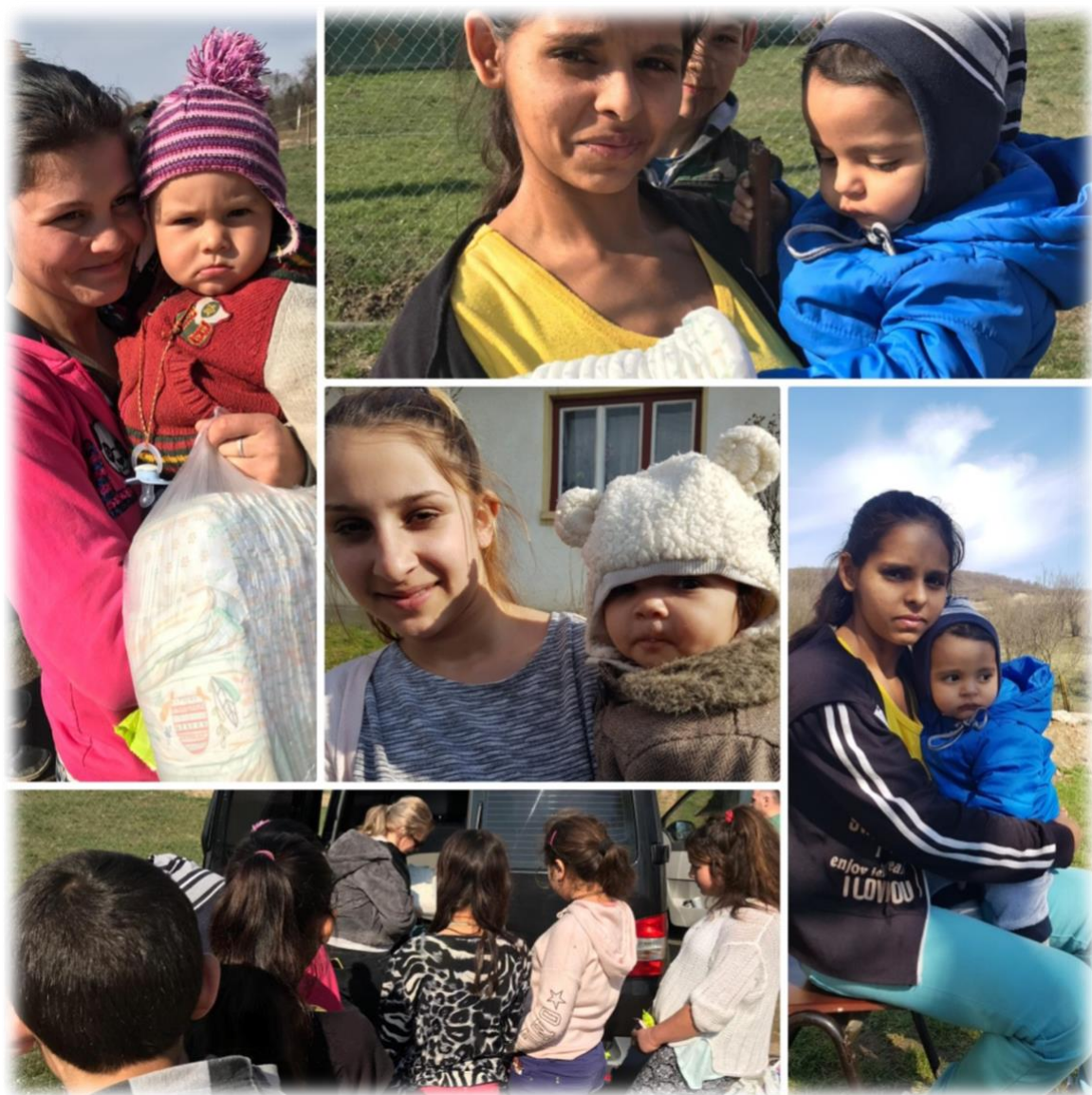
Cradle baby program- few young moms from Filitehnic